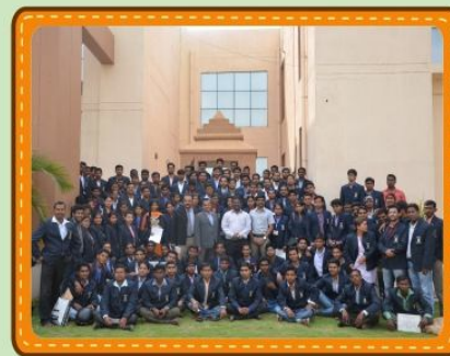
Two batches of Eco Guide Training Programme has been successful