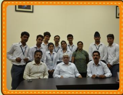
Airport Authority of India visits the campus for recruiting students