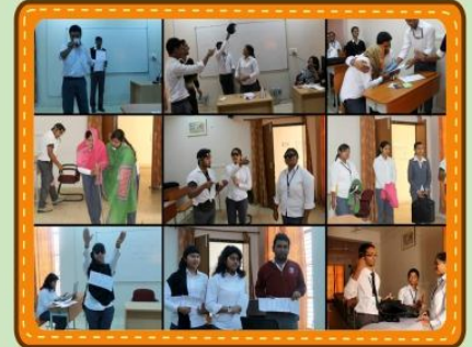
Role plays performed by students as part of Foundation day celebration